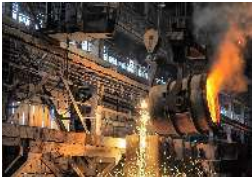
Iron and Steel